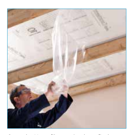
Once the U-profiles are in place, fit the glazing bar end caps. Finally, remove all protective film.

The U-profile should be cut into sections to fit between rafters. Run a bead of sealant along the top edge of the end cap to prevent water penetration. Fit U-profile into place with the drip detail leading into the gutter. Wipe off any excess sealant.