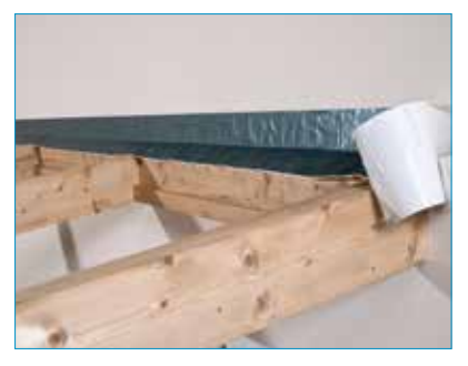
Begin the project by installing the flashing tape to provide a watertight seal between the wall and roof.