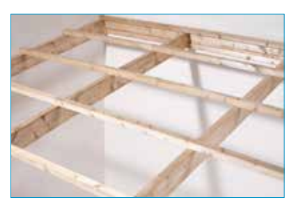
Screw the bottom half of the glazing bar to every purlin. Ensure the purlin spacing is not greater than 1,500mm.

Screws should be sealed in waterproof silicone sealant, wiping off any surplus after driving the screws.