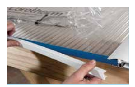
To protect the breather tape, fit end caps or U-profiles to the end of the sheet.

The U-profile should be cut into sections to fit between rafters. Run a bead of sealant along the top edge of the end cap to prevent water penetration. Fit U-profile into place with the drip detail leading into the gutter. Wipe off any excess sealant.