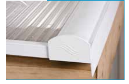
Fit the final glazing bar cap and complete the run of side flashing.