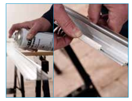
Insert seals, without stretching, on both sides of the bar base. Using silicone lubricant can make installation easier.