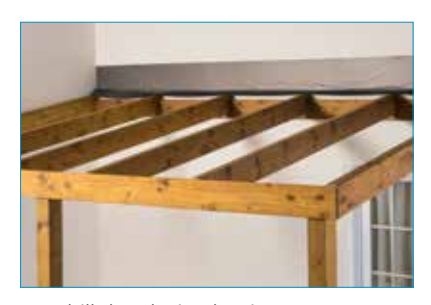
Pre-drill the glazing bar in preparation for fixing to the rafters - at approximately 400mm centers staggered on alternate sides.